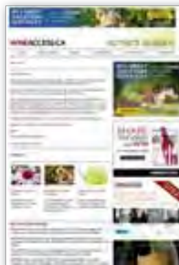
Wine Access Media Kit 2011 / 2012

Big Box (300 X 250) 72 DPI RGB File Size 40kb